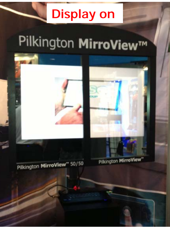
TV in off/on states with Pilkington MirroView <sup>™</sup> 50/50 (left hand side) and Pilkington MirroView <sup>™</sup> (right hand side) installed in front